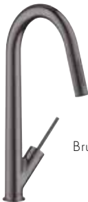
Brushed Black Chrome