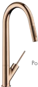
Polished Red Gold