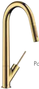
Polished Gold Optic