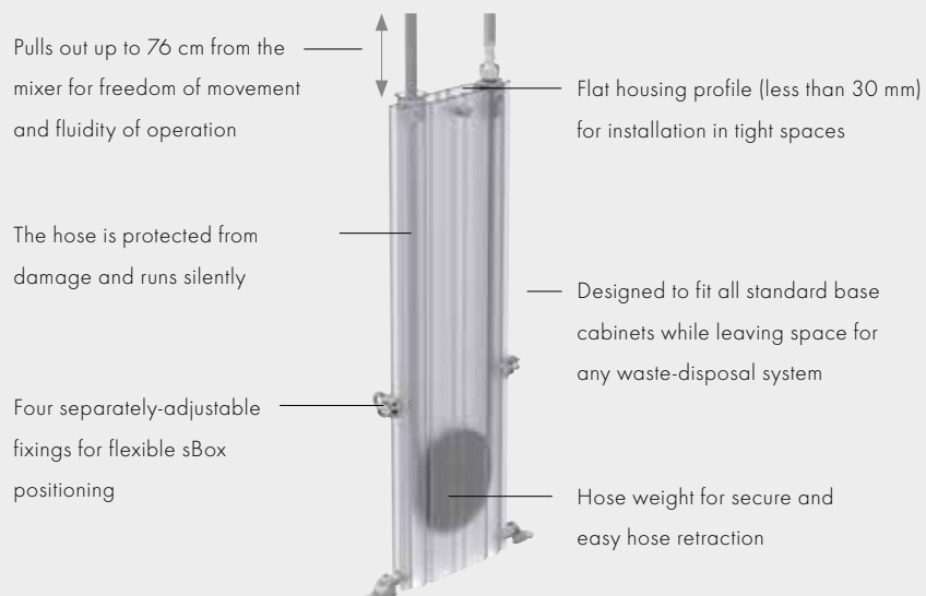
SINGLE LEVER KITCHEN MIXER SELECT 230 2JET WITH PULL-OUT SPRAY

Pulls out up to 76 cm from the mixer for freedom of movement and fluidity of operation