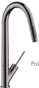
Polished Black Chrome