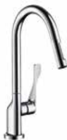
Single lever kitchen mixer 250 with pull-out spray # 39835, -000, -800, -XXX