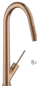
Brushed Red Gold