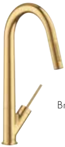
Brushed Gold Optic